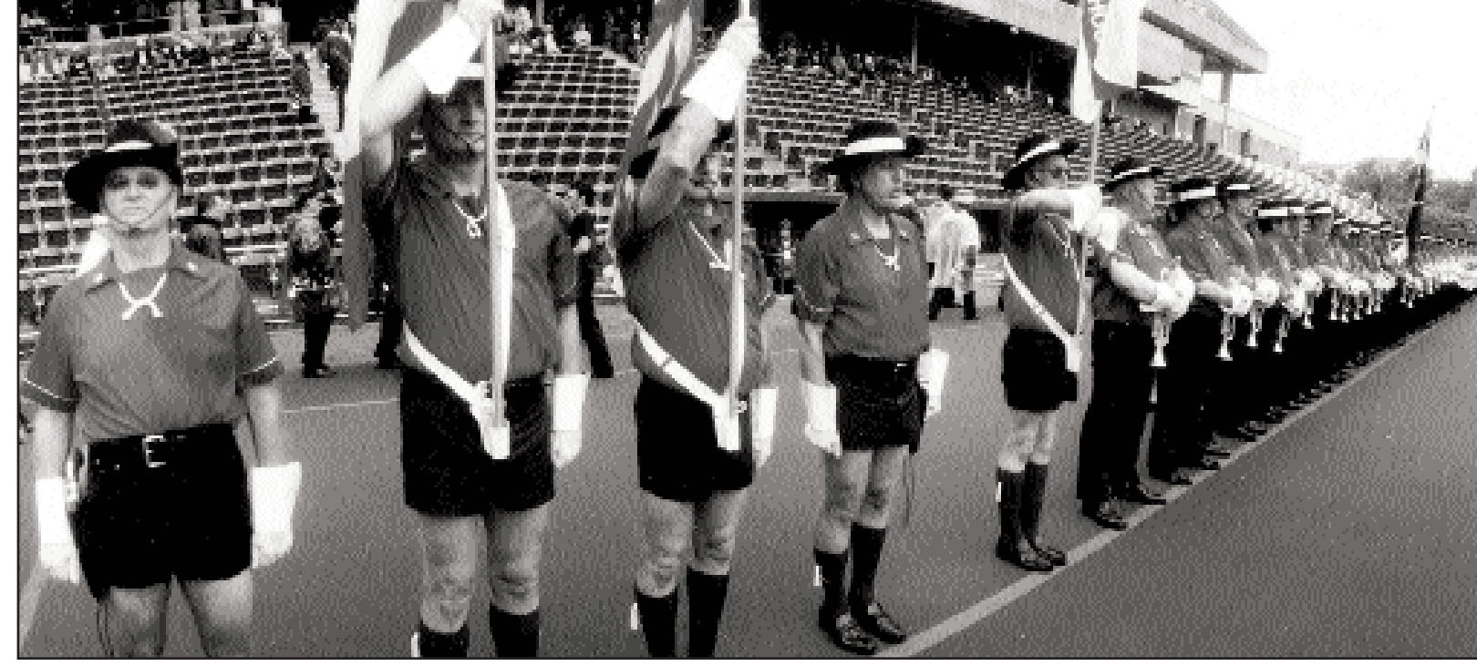
Scout House Alumni, September 1, 2002, during an exhibition at the the Drum Corps Associates "Alumni Spectacular" in Scranton, PA.

many Scout House alumni, won the senior championship.