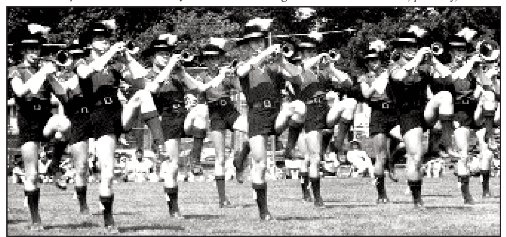
Scout House and their famous high leg lift, July 1, 1962, at Stratford, CT.

Disagreements about uniforms, publicity,