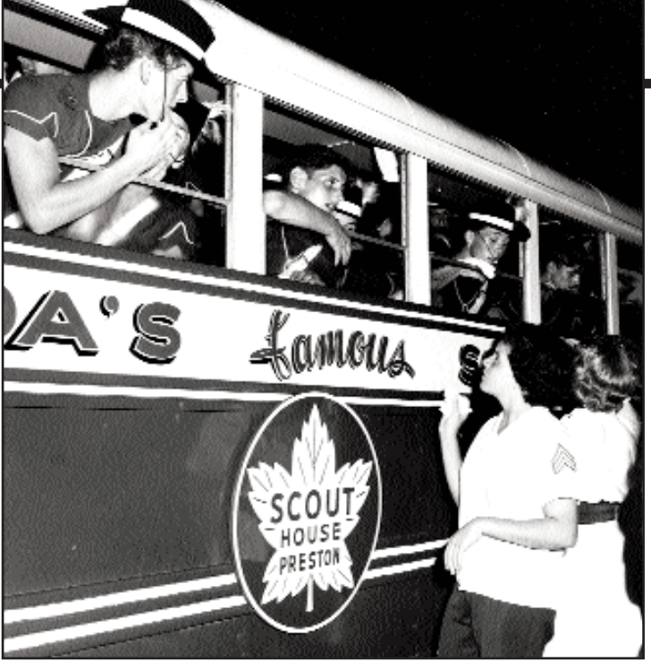
August 26, 1961, Scout House members were popular, often having "groupies" following them. They were in demand for autographs (photo by Moe Knox from the collection of Drum Corps World).

Scout House was an immediate contender. The unit won multiple titles at the prestigious Waterloo Festival. Although finishing first in some categories, a great deal of pride was taken in finishing fourth in the "test piece" category. The band had to perform a new piece of music correctly, note for note. Their achievement was amazing