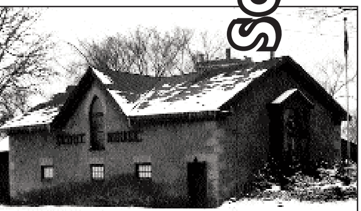
The Scout House building, with a showcase window on the end, still exists

The war years were good for the band and now prospective