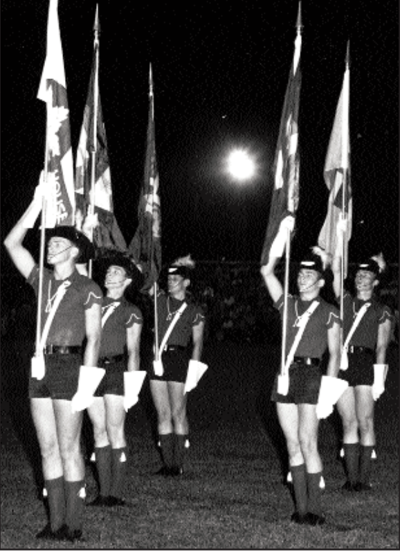
Scout House, 1961, during an exhibition in Stratford, CT (photo by Moe Knox from the collection of Drum Corps World).

Scout House thrived, in spite of (or because of depending on one's point of view) the lack of affiliation with the Scouts and soon fans throughout North America came to know the young men wearing the distinctive black shorts, knee socks, red shirts, white gauntlets and wide-brimmed Aussie hats,